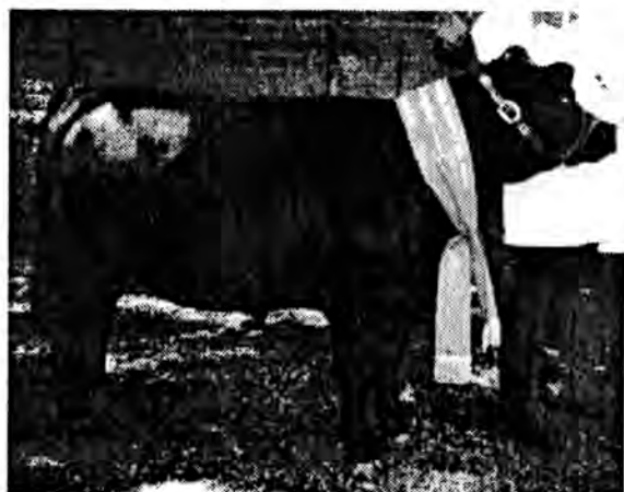
Red Hill Show:

Avonsleigh Lowline Stud, Samson 3rd Place, Elandra Cappella