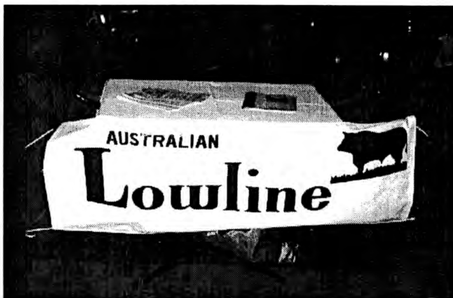
Victorian Farmers Federation Annual Dinner - What a night!