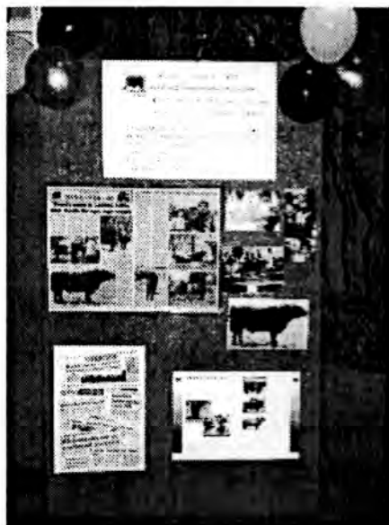
Story board displayed at the Annual Dinner