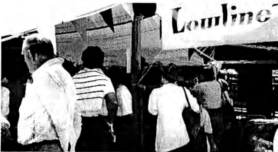
Lowlines at 9am half an hour after the gates opened