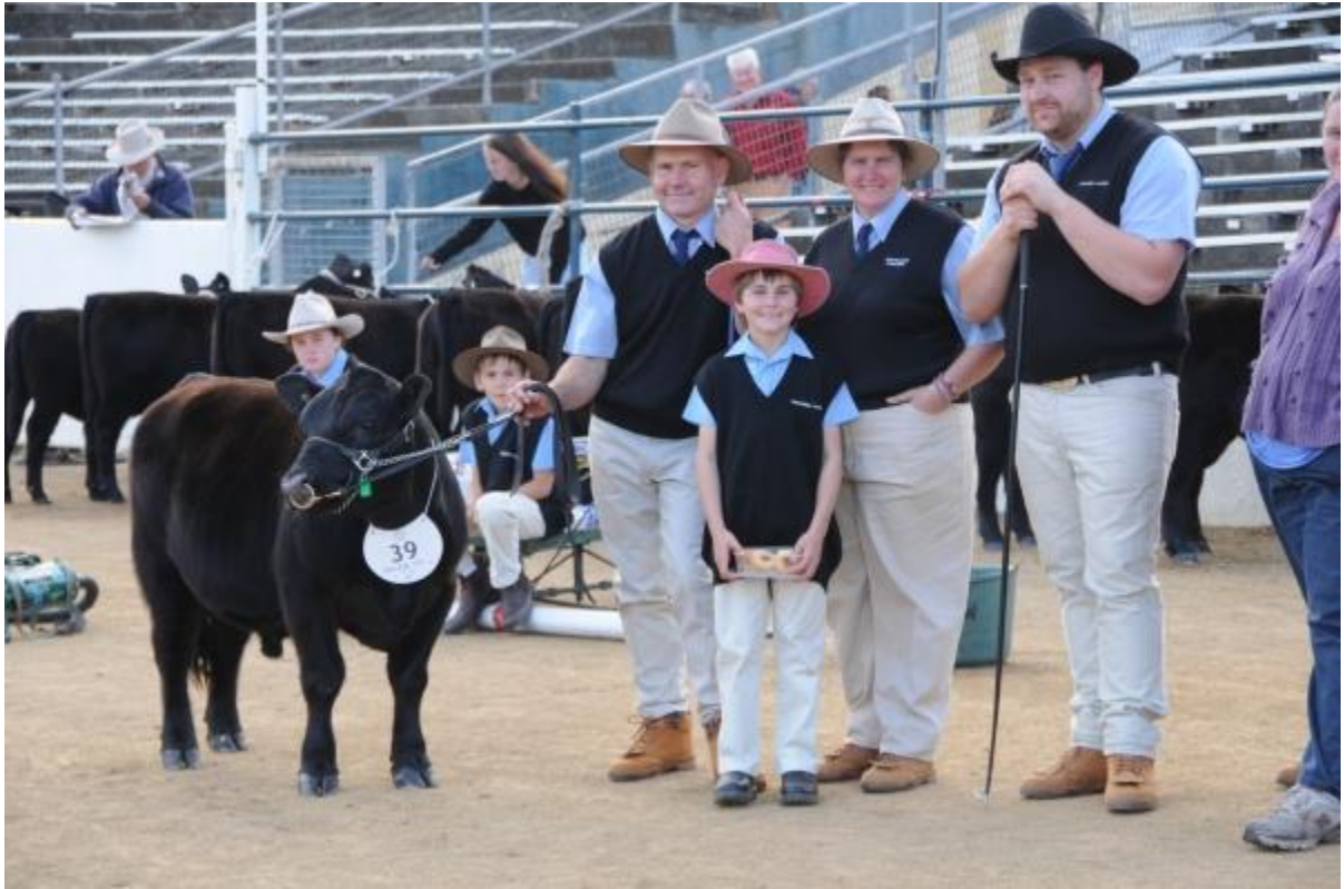
Tanview crew at Ekka, 2014