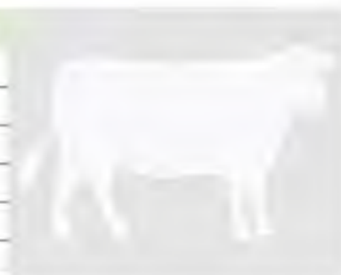
Figure 1: Reference points used for fat assessment