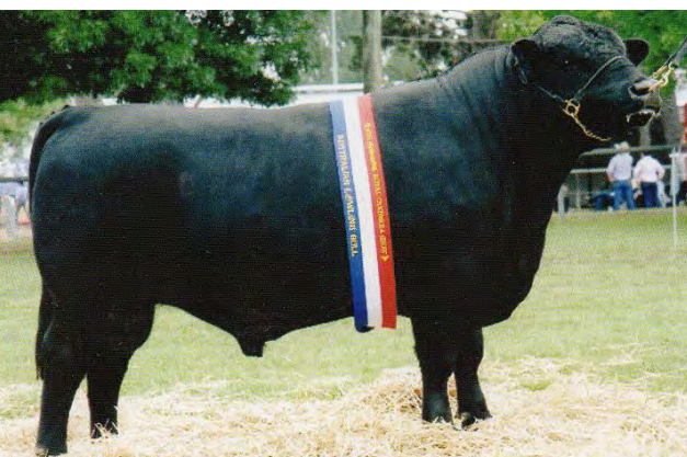
Senior Champion Bull – Urila Emperor