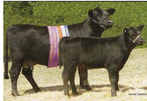
2008 – Senior & Grand Champion Female – Trungley Zirconia