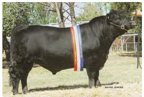
2008 Junior Champion Bull – Rivenmead Rolls Royce