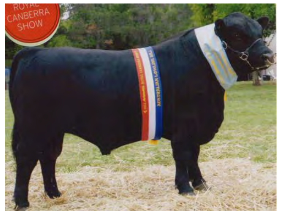
Junior & Grand Champion Bull –Tanview Fair Dinkim

2012 Canberra Australian Lowline Feature Show