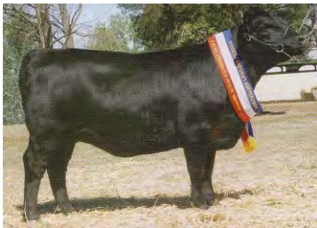
2008 – Junior Champion Female – Kemoi Poppie