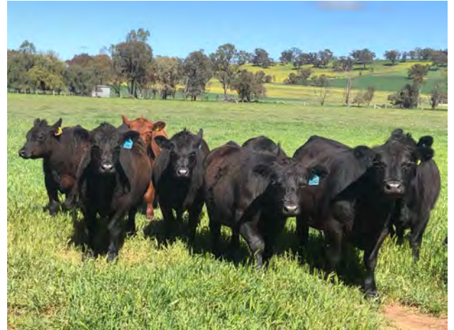
Lowline steers – Wanamara Farm, VIC

If your cattle are fully fed but are thin and not diseased, mineral deficiency will be limiting muscle and fat growth.