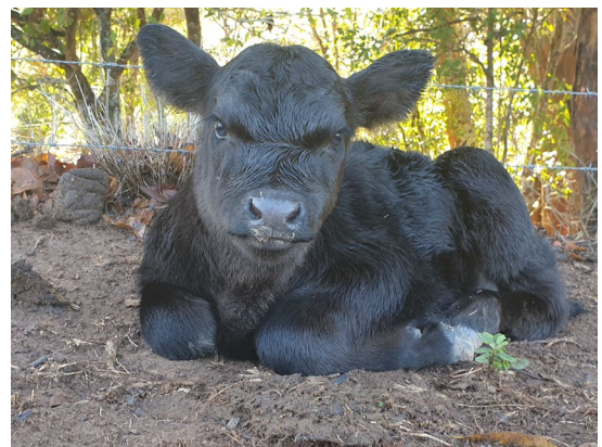
A Spring calf at McIntosh Creek

If you have any problems, please contact the ALCA office.