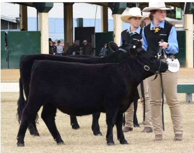
2022 EKKA – Lockyer Valley State High