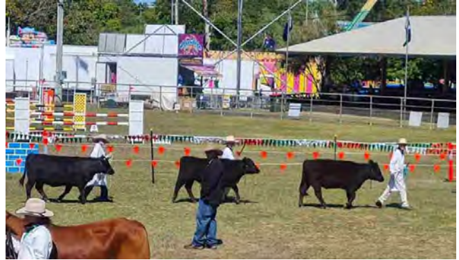
Columba Catholic College preparing & parading Coolindowns Lowlines at the Charters Towers Show, Qld.

It is great to see members out in force parading cattle at their local shows.