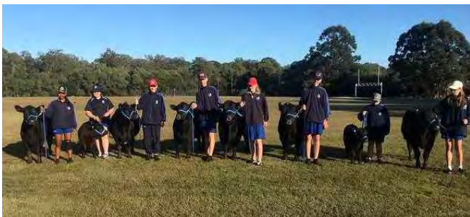
Dakabin State High School cattle show team & at the EKKA. Qld