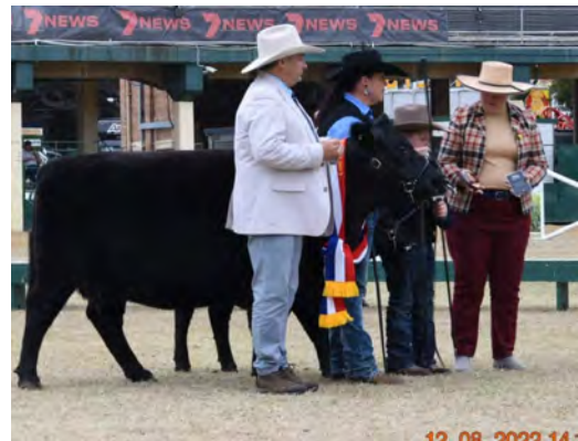
Tarrawarra Harmony Grand Champion Female