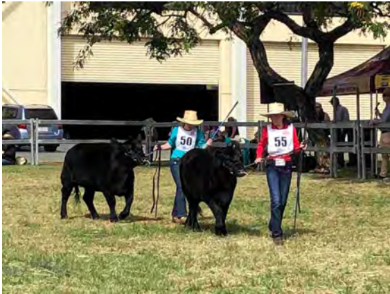
Merowen Lowlines at the Rockhampton Junior Beef Show, Qld