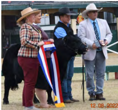
Leedar R U Perfect Grand Champion Bull & Supreme Exhibit