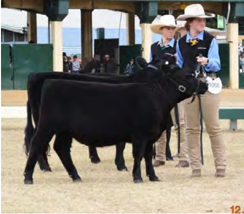
Lockyer State High

Judging was held on Friday 12 August with a great line up of Australian Lowlines. Congratulations to all exhibitors for presenting such beautifully prepared cattle.