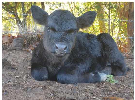
A Spring calf at McIntosh Creek

If you have any problems, please contact the ALCA office.