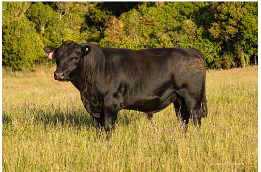
Right: Lowline Bull, Kaitake, Taranaki, NZ