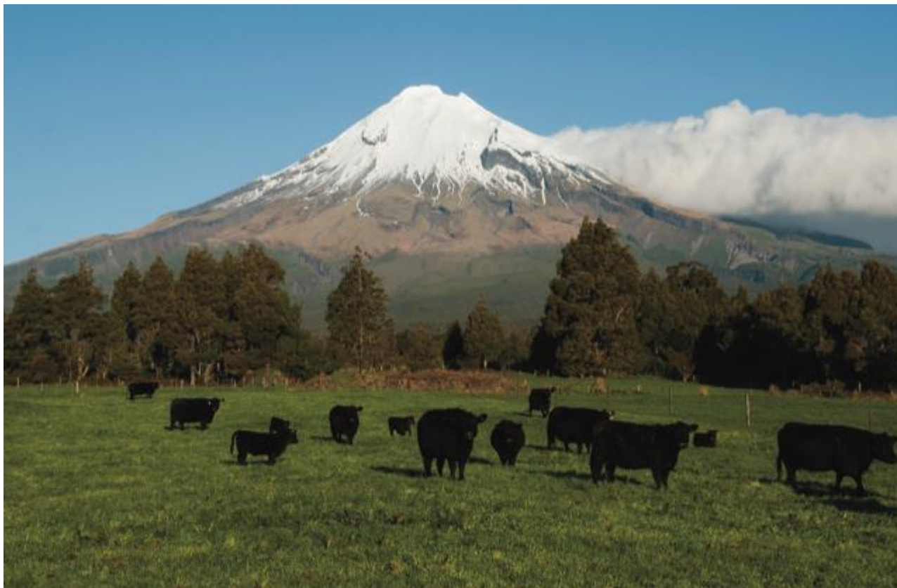
Kiatake Lowlines