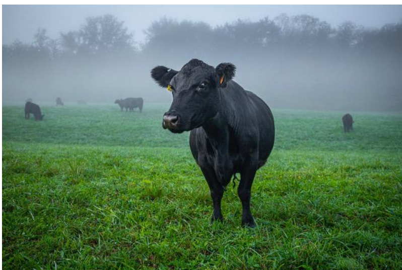
Left: Australian Lowlines in the mist