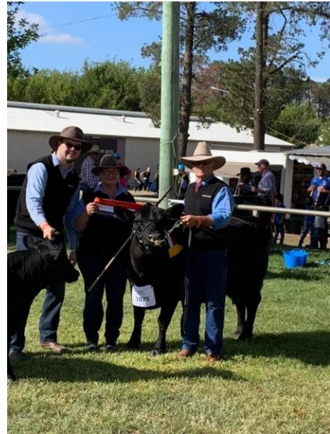
Grand Champion Female – Whitby Farm L.C.

Reserve Senior Champion Female – Cann Valley Lunar Eclipse