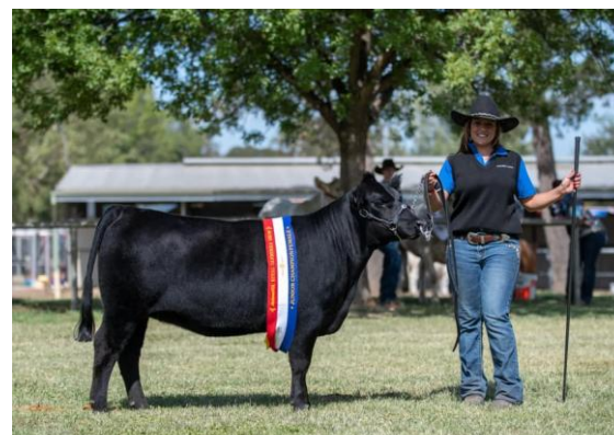
Junior Champion Female – Muscateer Valley Bree

Reserve Junior Champion – Tarrawarra Hughsie