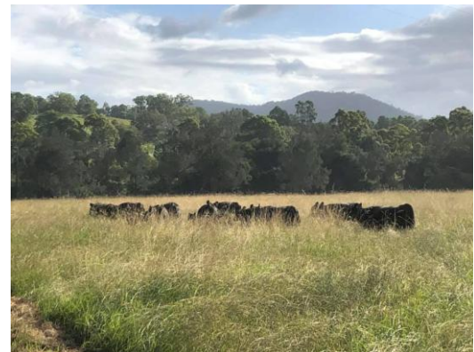
Elaman Creek Lowlines, Qld