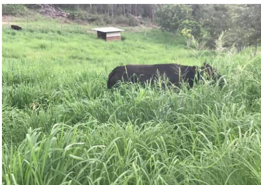
Mimburi Lowlines, Qld (left)