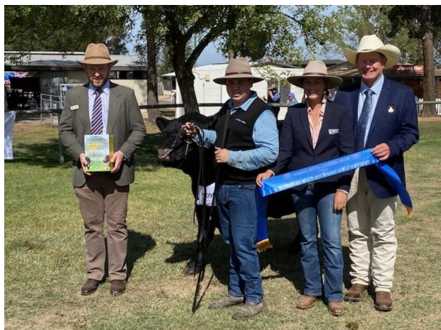
Grand Champion Bull – Cann Valley Nutcracker

Supreme Exhibit – Cann Valley Nut Cracker