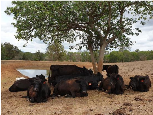
McIntosh Creek Lowlines, Qld

After the long dry spell, most areas have finally had rain. It is amazing the difference a bit of rain makes to the farm.