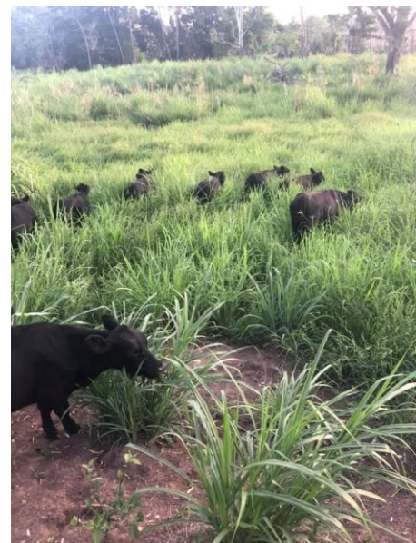
Ebony River Lowlines, Qld