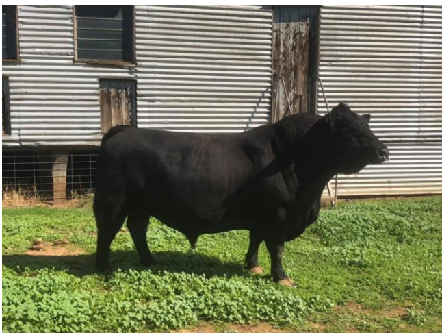
A well balanced bull with correct conformation

If we keep breeding with what we have, nothing really changes. There is now plenty of opportunity for breeders to use AI with imported Australian semen, and take advantage of many years of the Australian breeders selecting animals that produce beef. There are breeders in NZ using Australian Lowline semen with instant and obvious results.