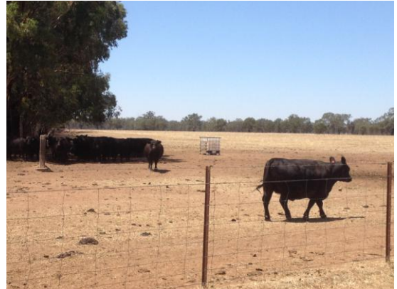
Wanamara Lowlines, Vic.