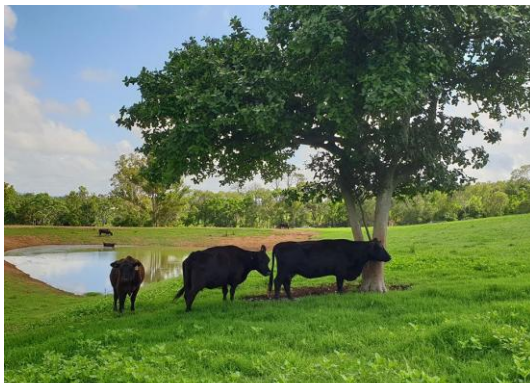
McIntosh Creek, Qld (above & below)