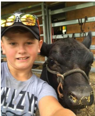
Pippa & Me