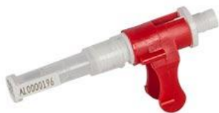
Tube loading apparatus & cutter

Sample integrity. The TSU is fully sealed and positively identified with both a 2D barcode and ID panel. The TSU can be paired to matching NLIS and Management tags, creating an absolute sample-to-animal linkage.