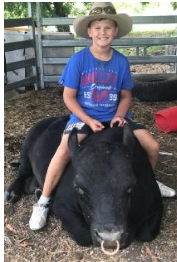
Mac, my stud bull

For the next edition of the newsletter –