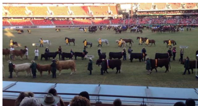
Sydney Show Lowline Champions on parade