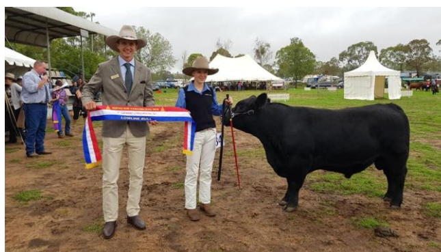
Grand Champion Bull – Lik Lik Notorious