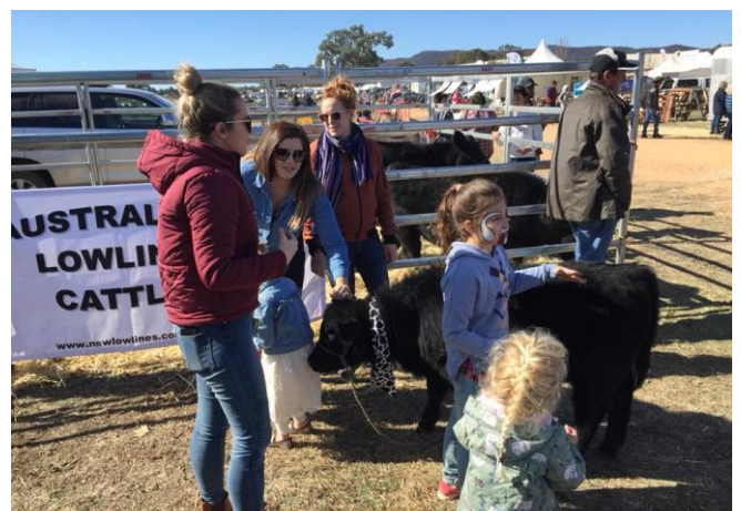
Pickles & some of his admirers at Mudgee Field Days