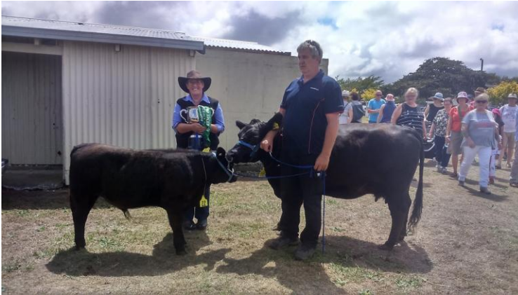
Triple M Lowlines - Supreme Lifestyle Champion Animal at the Horowhenua Show, NZ