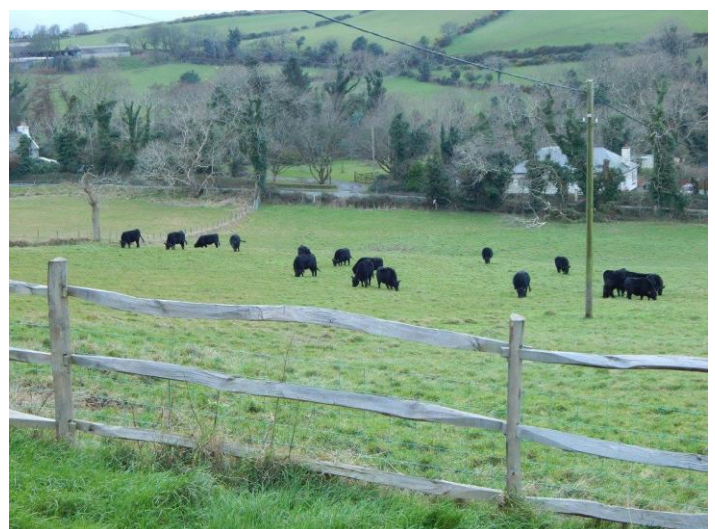
Cammall Farm Australian Lowlines 2017