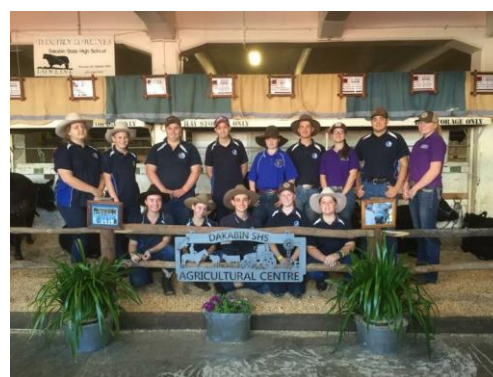
Dakabin State High School Show Team