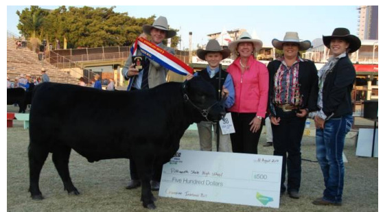
Junior, Grand Champion Bull & Small Breeds Interbreed Champion Bull – Pittsworth Model owned & bred by Pittsworth State High School