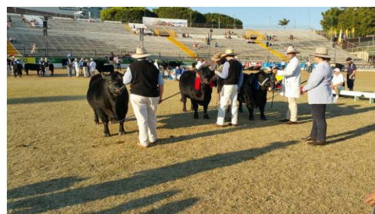
Senior bull class