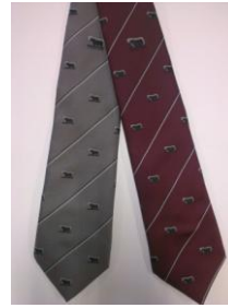
Lowline Breed Ties

Australian Lowlines had 100 animals at the 2000 Royal Melbourne Show so lets make this one bigger and better!