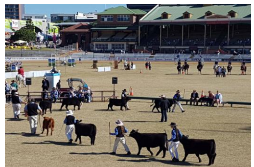
Lowlines on parade at the EKKA