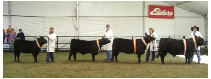
Major winners at the Lowline Feature Show at Adelaide in 2005 were from Allambie Stud, Dubbo NSW

Don't forget to visit the Lowline exhibitors at the 2017 Royal Adelaide Show from 1 st – 4 th September at the Adelaide Showgrounds.