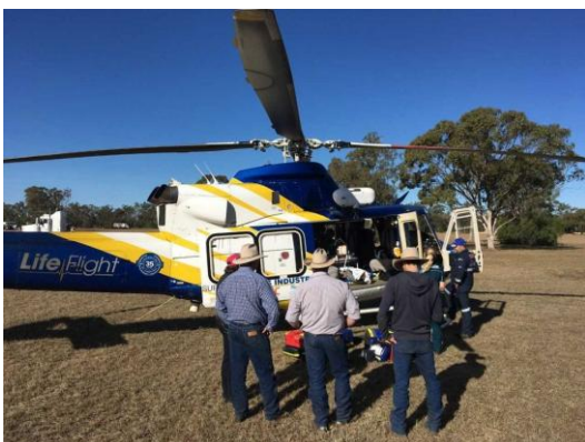
A Toowoomba-based LifeFlight helicopter airlifted a teen after he fell from his horse at Condamine.

It was one of six primary missions in less than 24 hours for LifeFlight crews at the weekend, including four motor vehicle incidents.