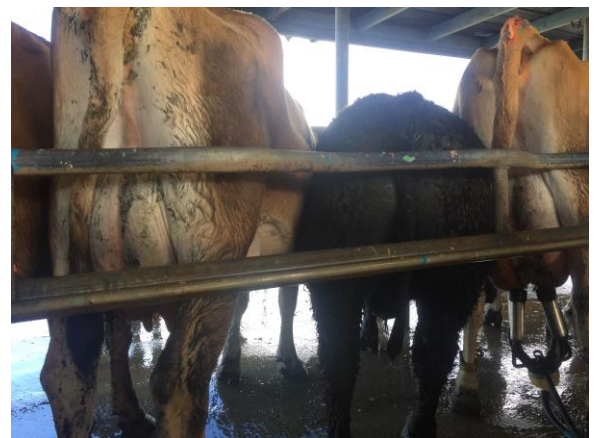
One of the smallest Lowline bulls at Lowland Park lined up with the dairy cows