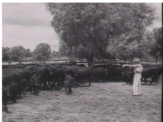
Trangie cattle in 1951