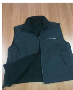
Lowline Reversible Jacket