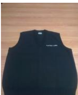
Lowline Breed Vest (for shows)

Or contact Carole at the ALCA Office to place your order (02) 6773 3295