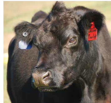
Broken Arrow Moonlight DOB 22.4.1997