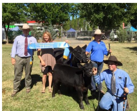
Supreme Exhibit – Rotherwood Glamour Girl

You will be notified when the website is about to be launched. Then check it out & let us know what you think!