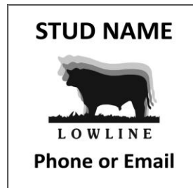
Farm Gate Sign

This is a great promotion for the commercial use of Lowline bulls.