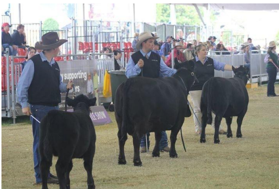
Judging for Grand Champion Lowline Female between Rotherwood Glamour Girl (Senior Champion) & Blue Gem Little Star (Junior Champion)